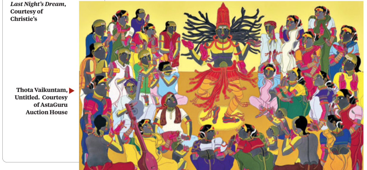
Thota Vaikuntam, Untitled .