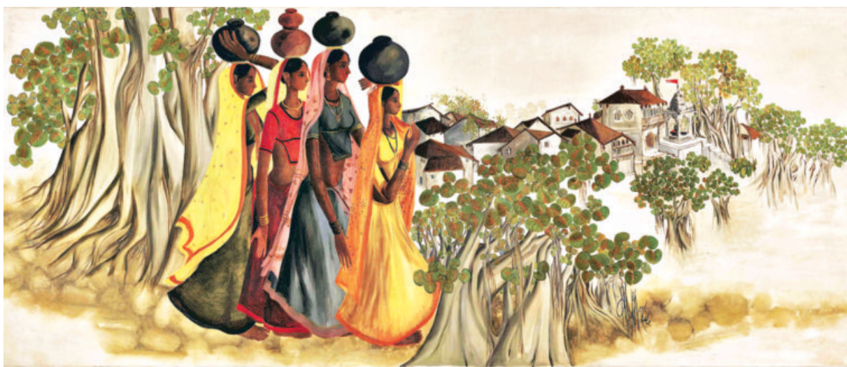
B Prabha, Untitled .